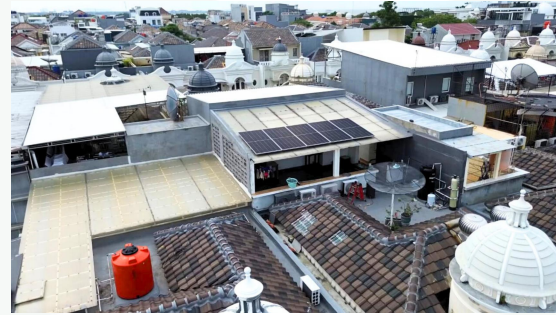
Pantai Indah Kapuk